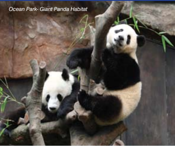
Ocean Park- Giant Panda Habitat