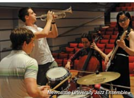
Newcastle University Jazz Ensemble.

Shopping, heritage, entertainment, recreation, food culture not to mention some of the most stunning views all can be captured in this thriving international metropolis. Witness the blend of Chinese and Western cultures as they flourish together to make Hong Kong one of the most striking cities in the world. Shop in the open air bazaars, visit the former fishing villages such as Aberdeen now home to the worlds largest floating restaurant, catch the Star Ferry across Victoria Harbour one of the three natural deep water harbours in the world or explore the outer islands that surround Hong Kong including the Buddhist Kingdom of Po Lin Monastery.