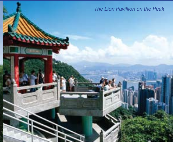
The Lion Pavilion on the Peak