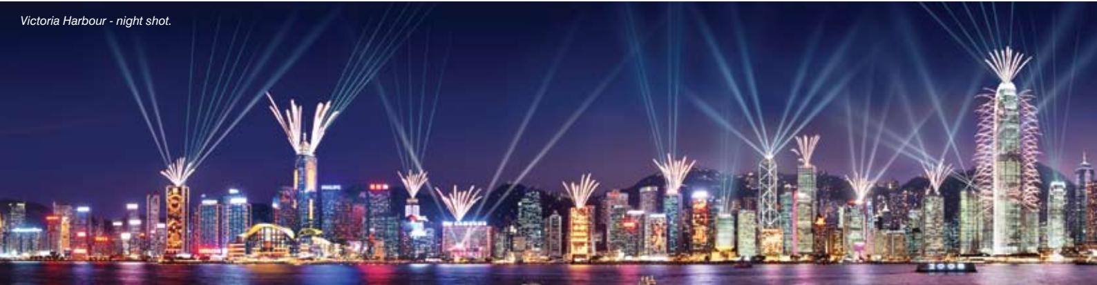
Victoria Harbour - night shot.

FESTIVAL FOR ORCHESTRAS | BANDS | CHOIRS | STAGE BANDS | JAZZ ENSEMBLES