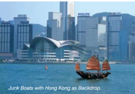
Junk Boats with Hong Kong as Backdrop.