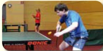
Table Tennis girls and boys, U18 - U16 - U14