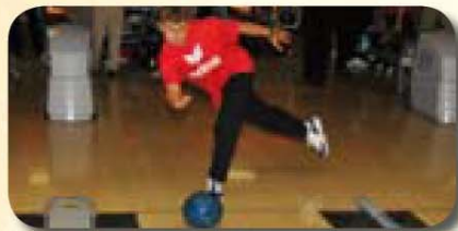
Bowling girls and boys, U18 - U14