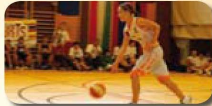
Basketball girls and boys, U18 - U16 - U14