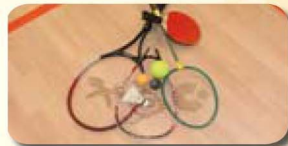
Racketlon girls and boys, U18 - U16 - U14