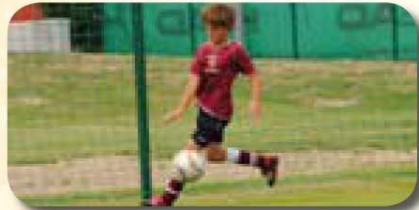
Soccer girls and boys, U17 - U15 - U13