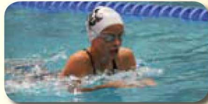
Swimming girls and boys, U18 - U16 - U14 - U12