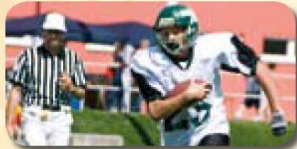
American Football boys, U18 - U16