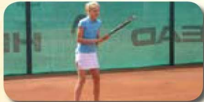
Tennis girls and boys, U18 - U14