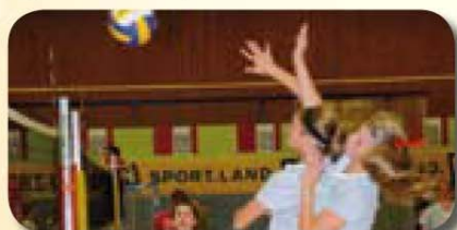
Volleyball girls, U17 - U15